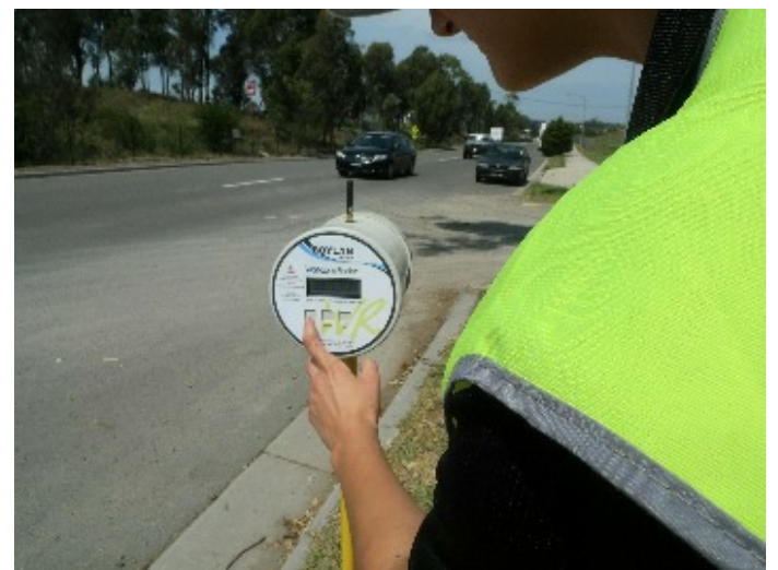
Easy to setup and deploy to the workzone