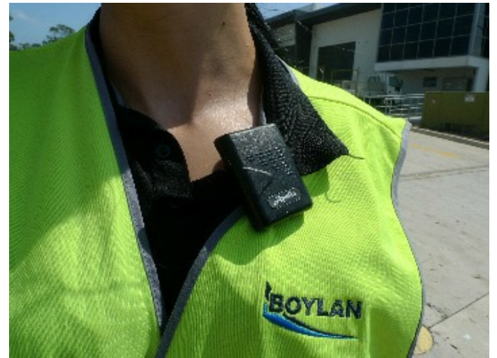
Rechargeable personal alert (vibration & sound) Multiple devices may be triggered.