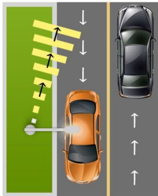
Armadillo on the side with 1 lane each direction