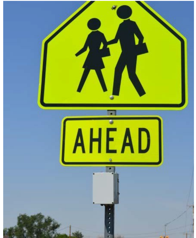
Temporary Shoulder Mount