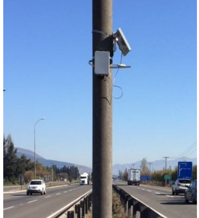
Permanent Median Mount with Solar