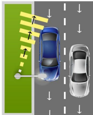
Armadillo on the side with 2 lanes incoming. No outgoing lanes can be detected