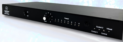
In - Cabinet Unit