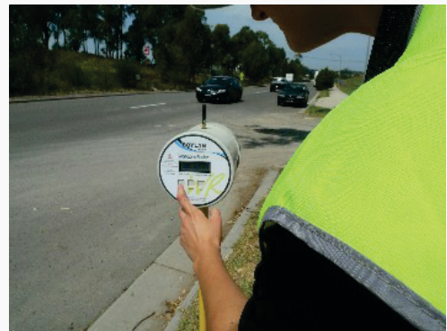
Easy to setup and deploy to the workzone