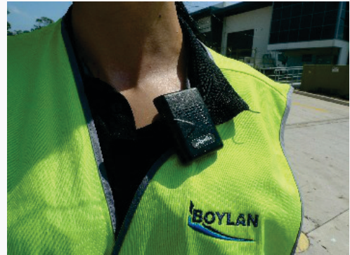
Rechargeable personal alert (vibration & sound) Multiple devices may be triggered.